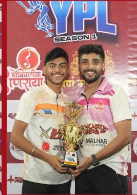
RUNNERS UP TROPHY