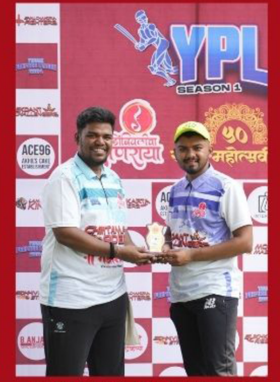
MAN OF THE MATCH