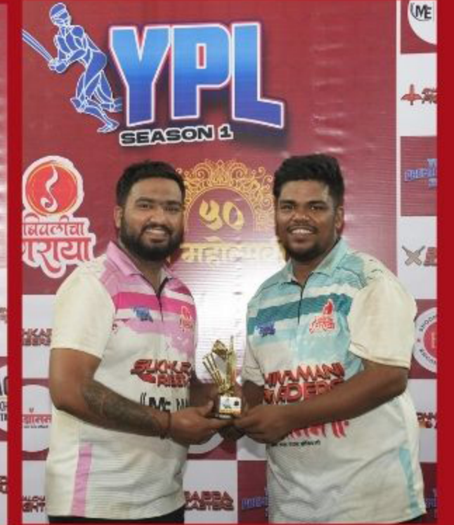
PLAYER OF THE TOURNAMENT